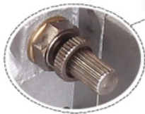
Easy Weld Adjustment